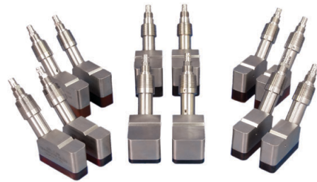
GE technologically advanced clamp-on gas ultrasonic transducers

The new line of clamp-on gas transducers produces signals that are five to ten times more powerful than those of traditional ultrasonic transducers. The new transducers produce clean, coded signals with very minimal background noise. The result is that the GC868 flowmeter system performs well even with low-density gas applications.